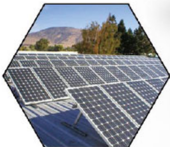
Solar tracking system